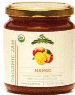
Organic Mango Jam

Combining the exotic tropical flavors of Papaya and crunchy sweet Coconut, we have created a unique jam that is simply amazing. This sweet flavored jam is great on toast, paired with cheese or just a spoonful on ice cream.