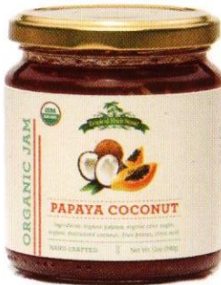
Organic Papaya Coconut Jam

Intensely flavored with the perfect balance of sweet and tart, our Passion Fruit jam is our most popular. With its crunchy yet edible seeds this jam is amazing with pancakes, paired with cheese and as a glaze on meats.