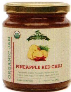
Organic Pineapple Red Chili Jam

Made with mango and chili native to Sri Lanka, our Organic Mango Red Chili Jam is refreshing, sweet and just the right amount of heat. This jam is great as a glaze on meat, with cheese or accompaniment for your breakfast.