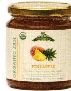
Organic Pineapple Jam

Made from mango native to Sri Lanka, bursting with flavor, our Mango Jam is refreshing and sweet. Using a slow cooking process we have crated a truly remarkable jam which can be enjoyed with cheese, ice cream, yogurt or on toast to enhance your breakfast.