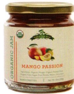
Organic Mango Passion Jam

Hand selected pineapples that are ripened to perfection are combined with red chilies to create this jam, which is the perfect balance of sweet and heat. This jam pairs great with cheese, makes a great marinade or enjoy it with a bagel and cream cheese.