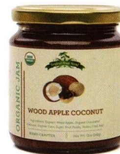
Organic Wood Apple Coconut Jam

What could be better! Infusing specially selected mango with passion fruit to accentuate the flavor, this jam is a combination of our most popular flavors. Pairs well with cheese, mix in with greek yogurt or use in baking.