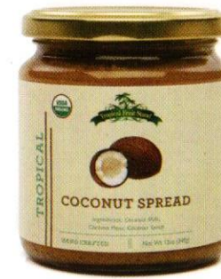
Organic Coconut Spread

Native to South Asia, the Wood Apple is a fruit that is unlike any other. From its hard shell to the pulp like fruit and the subtle flavors of sweet and tart. This low sugar fruit is as unique as it gets. Adding coconut to enhance its flavor, this jam is great on toast, bagels or enjoy a spoonful with yogurt.